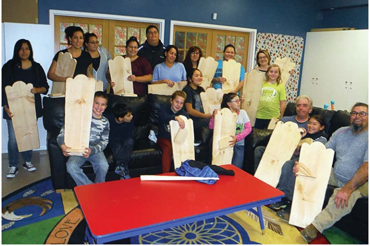
Where the Creek Runs Clearer group with their cradleboards.

here the Creek Runs Clearer is a KSCS teen program that started in 2001. The program started at the request of the community who wanted their children to learn the customs and rituals of the Kanien'kehá:ka people.