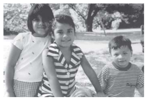
Normal vision.

If left untreated, proliferative retinopathy can cause severe vision loss and even blindness. Also, the earlier you receive treatment, the more likely treatment will be effective.