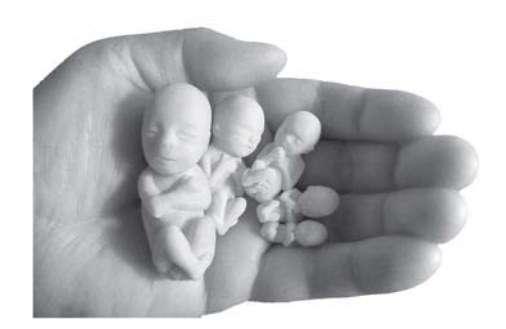
Life-size models of babies from 7-12 weeks after conception.