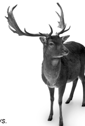
Cover design: Marie David