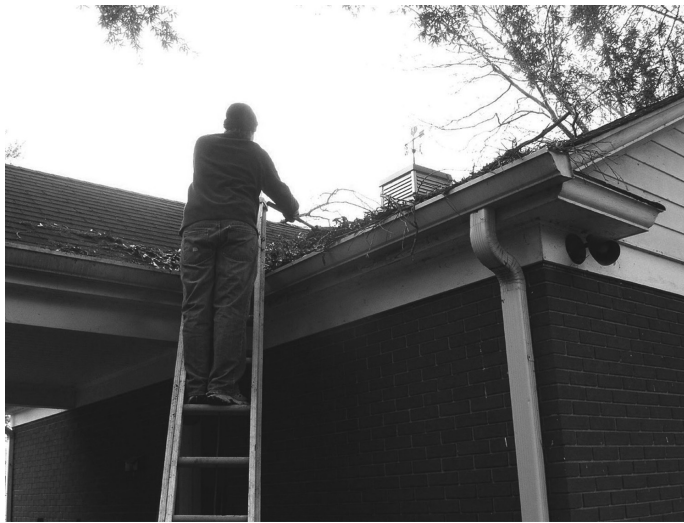
Preparing for winter by cleaning the gutters.