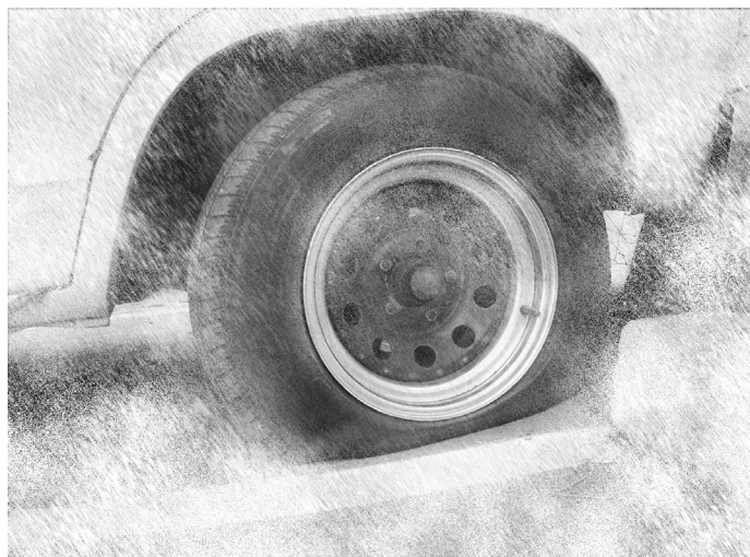
A flat tire in winter. Are you prepared?

If we notice there is a problem, it can be addressed at a time that is less inconvenient. This is especially true if we were leaving on a longer family vacation trip where the negative effects of getting a flat tire are increased.