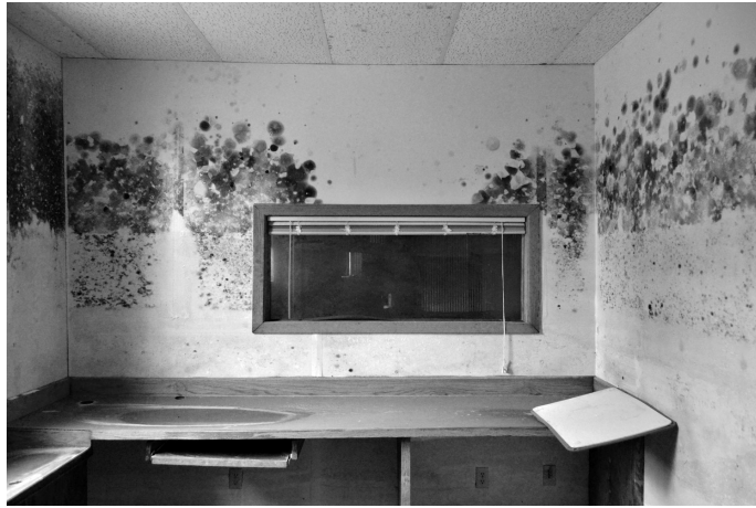
An instance of mould in a church basement.

The kitchen is another breeding ground for the spread of mould. Leaky faucets, water spills and steam from cooking add to high moisture levels in a home. Obvious signs of mould are a black sooty or fuzzy growth on surfaces.