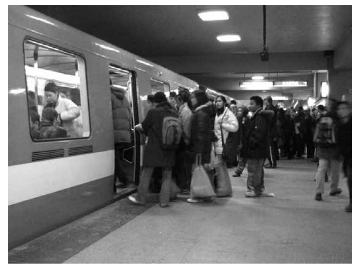
The Montréal metro at rush hour.